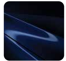
Deep Crystal Blue Mica