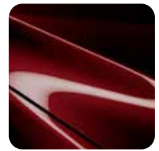
Artisan Red Metallic