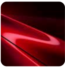
Soul Red Crystal Metallic