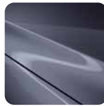
Polymetal Grey Metallic