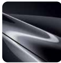
Machine Grey Metallic