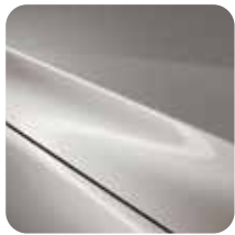
Platinum Quartz Metallic