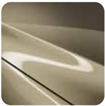
Zircon Sand Metallic