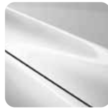
Snowflake White Pearl Mica