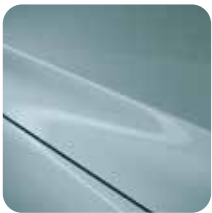
Air Stream Blue Metallic