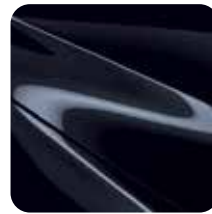
Jet Black Mica