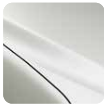
Rhodium White Metallic