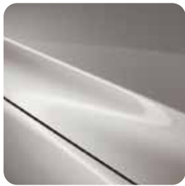
Platinum Quartz Metallic